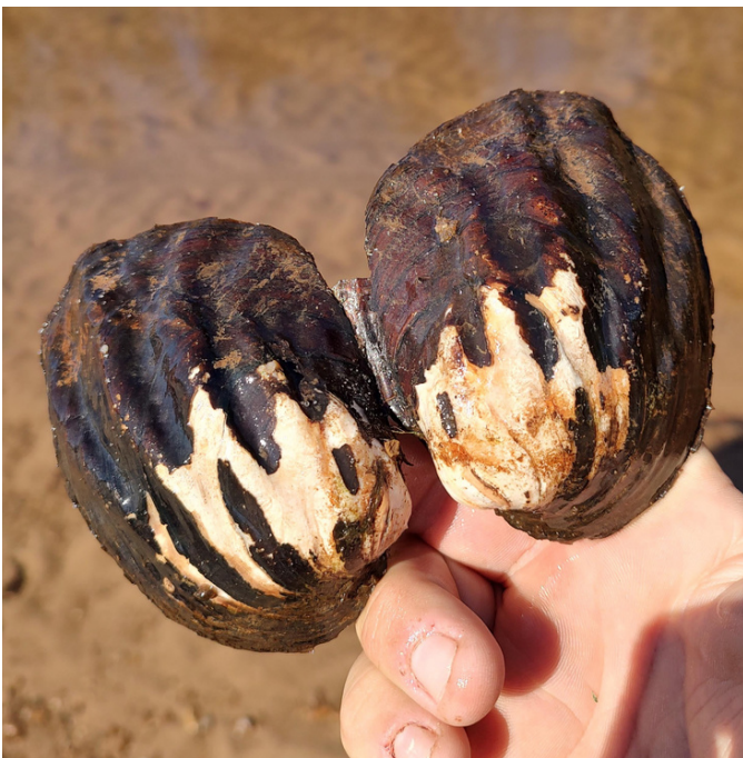
Threeridge mussel ( Amblema plicata )