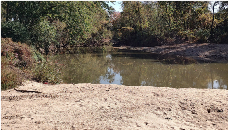
John's Creek right before it enters Nonconnah Creek